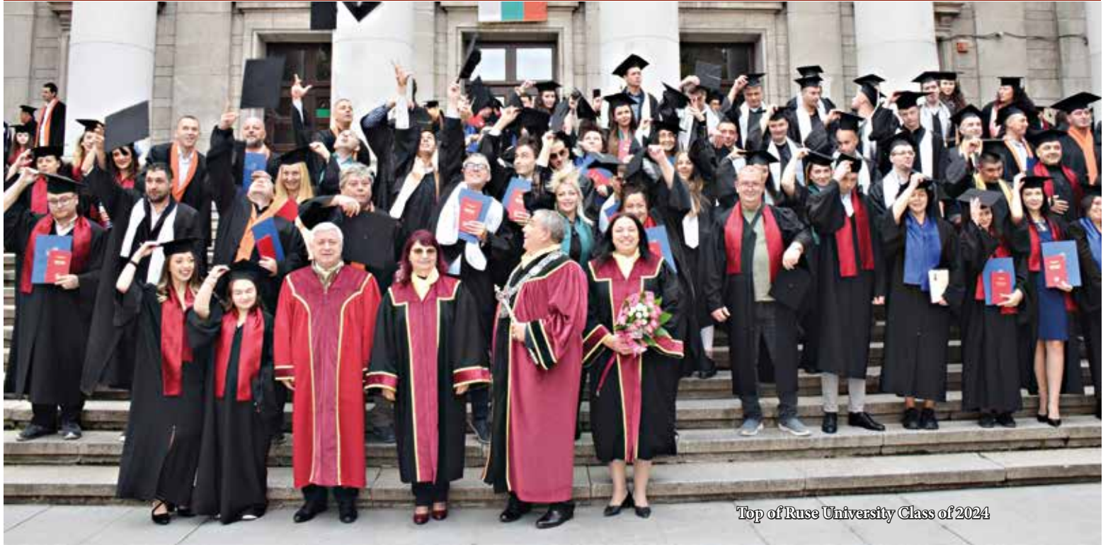
Top of Ruse University Class of 2024