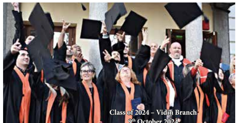
Class of 2024 – Vidin Branch 9 th October 2024