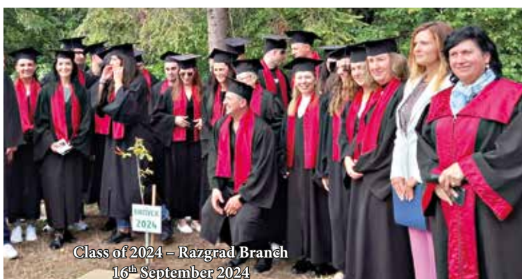
Class of 2024 – Razgrad Branch 16 th September 2024