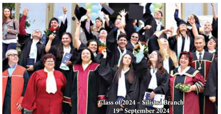
Class of 2024 – Silistra Branch 19 th September 2024